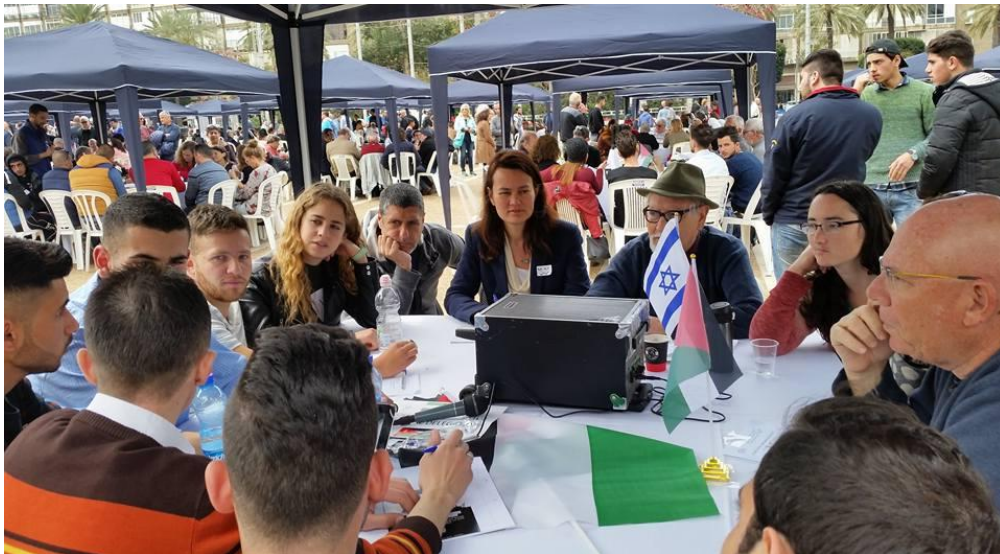
Public peace negotiations at Rabin Square in Tel Aviv (2017). Organized by Minds of Peace.