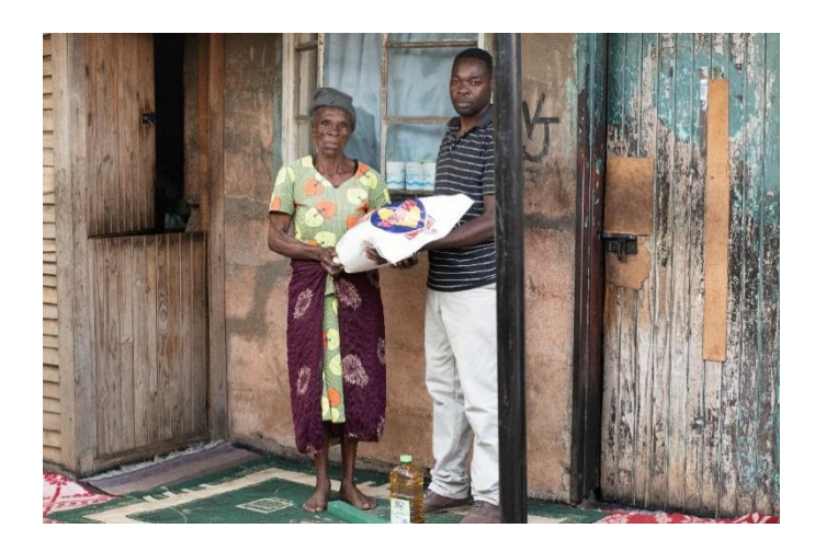
Photo: providing food to elderly women in the Old Location Sakubva in Zimbabwe

The community members listened intently as Jussa and his team explained various water harvesting methods, such as rooftop rainwater harvesting, ground-level rainwater collection, and even fog collection, amongst others. With every new idea shared, the residents began to see a glimmer of hope; these techniques could transform their struggle into a story of resilience.