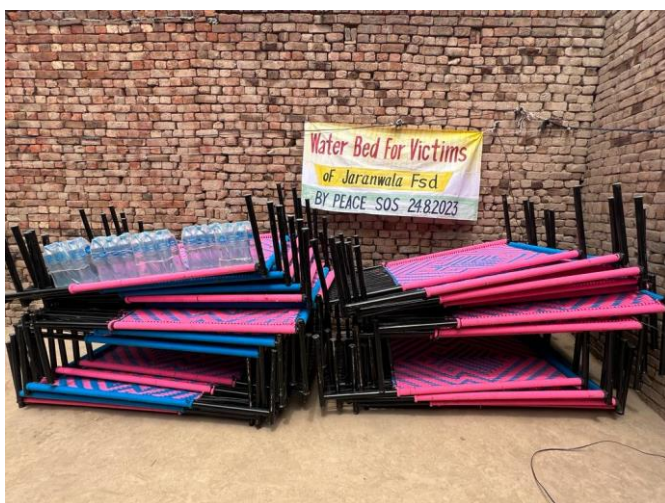
Photo: Beds and water for the vulnerable people of Jaranwala