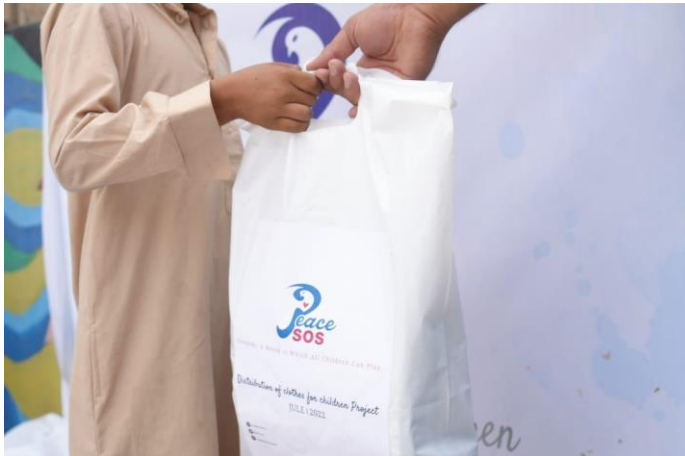
Photo: Clothes for a vulnerable child in Yemen

Some children are bullied because they wear torn clothes. They received new clothes for Eid al-Adha on 8 July 2022. They can wear the clothes after Eid. The clothes were made by tailors to support their small projects so that they can expand their activity and help them under these harsh economic conditions.