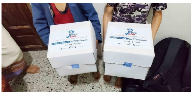
Photo: clothes for the children of the juvenile home

Furthermore, clothes were being provided to homeless children.