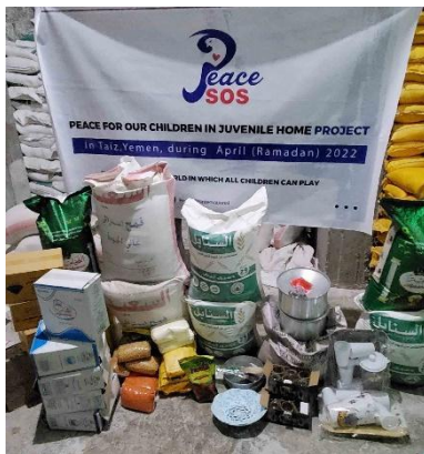
Photo: Food for the children and staff of the juvenile home Yemen

Another project was the providing of food and clothes to children of a juvenile home in Taiz.