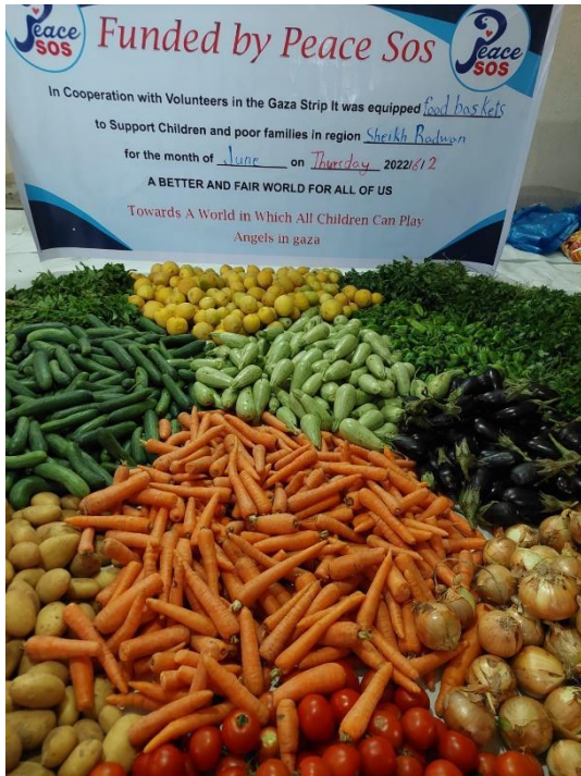
Photo: Vegetables for the people in Sheikh Radwan