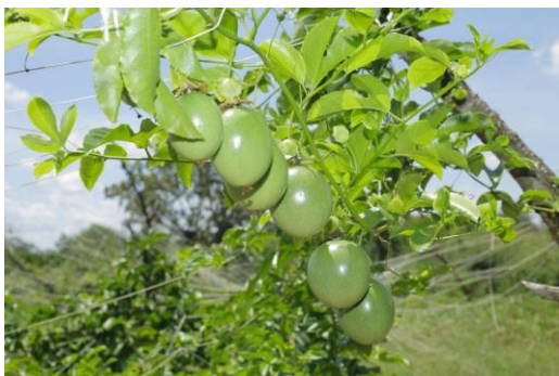
Photo: passion fruits