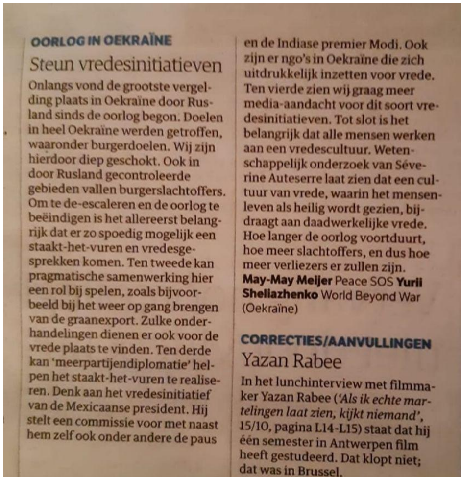
Photo: Letter to call for support of peace initiatives for Ukraine