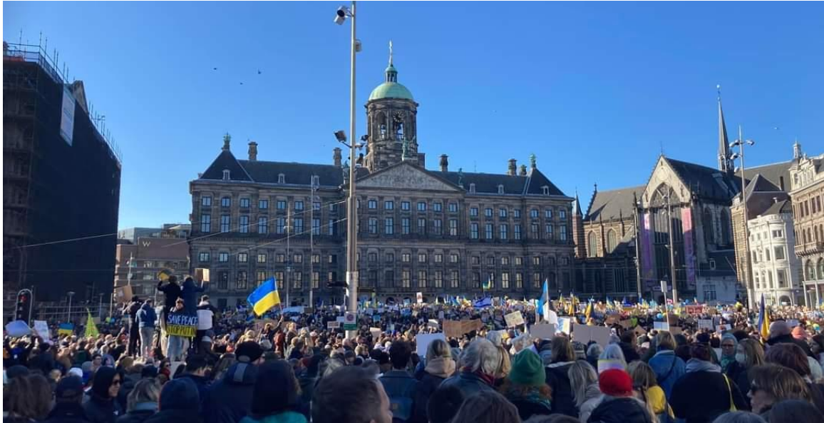
Photo: Around 15,000 people at Dam Square to show their solidarity with the people in Ukraine

Development, Church and Peace, Peacemission without Weapons, Universal Peace Federation, Womens Federation for World Peace.