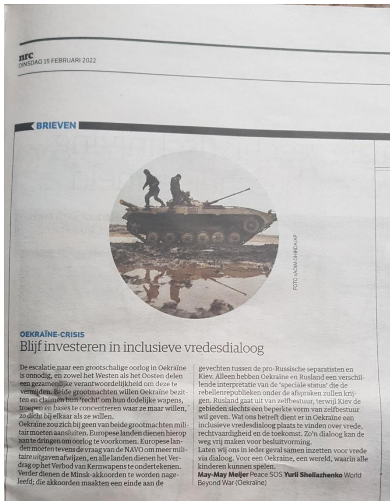
Photo: Letter to call for an inclusive peace dialogue in Ukraine