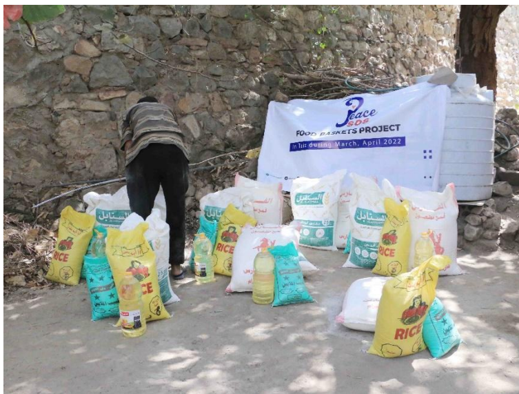
Photo: food baskets provided to vulnerable families

The war in Yemen, one of the poorest countries in the Arab world, is a humanitarian tragedy. To help vulnerable displaced families in different areas in Taiz Governorate, Yemen, Peace SOS donated food baskets to 270 people, including 98 children, 63 women, 70 men, 29 elderly, and 19 people with special needs. The distribution took place in late March 2022 so that the food baskets were received during the holy month of Ramadan as well as providing food during the war that has affected everyone.