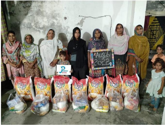
Photo: food provided to the women by the spiritual care taker

The projects in Pakistan of the spiritual care taker are being monitored via photo's and video calls.