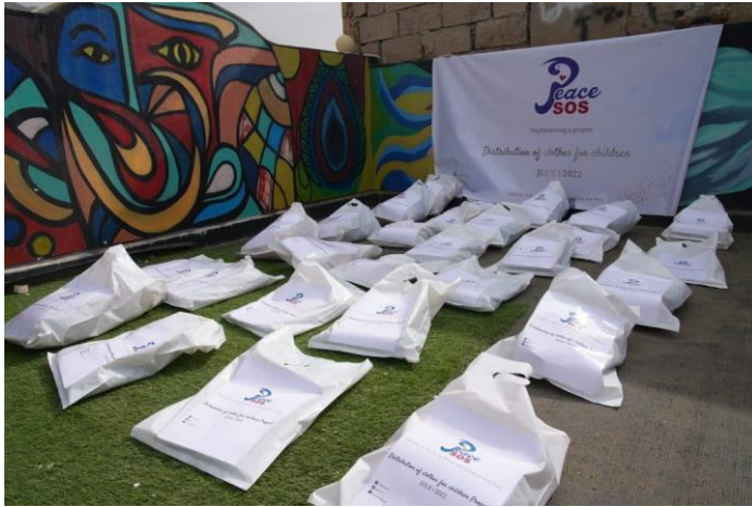
Photo: Clothes for homeless children in Yemen

Some children are bullied because they wear torn clothes. They received new clothes for Eid al-Adha on 8 July 2022. They can wear the clothes after Eid. The clothes were made by tailors to support their small projects so that they can expand their activity and help them under these harsh economic conditions.