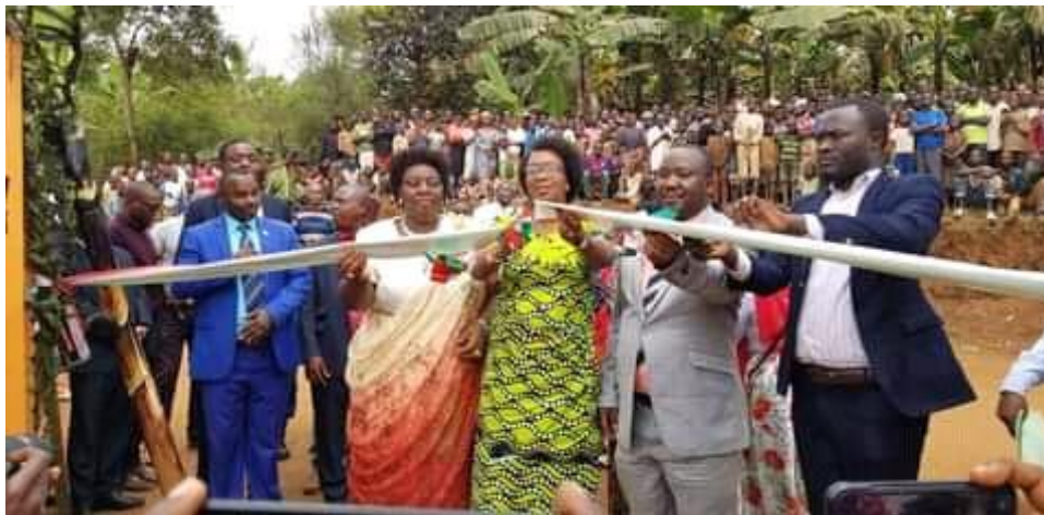
Photo: Opening of the community radio in Kirundo by the Minister of Communication (in green) and others.

Our partner Burundian Women for Peace and Development (BWPD) opened in July 2021 community radio in Kirundo. The opening was attended by the Burundi minister of Communication. Peace SOS sponsored three microphones for the journalists. The funding was provided thanks to an award from PricewaterhouseCoopers.