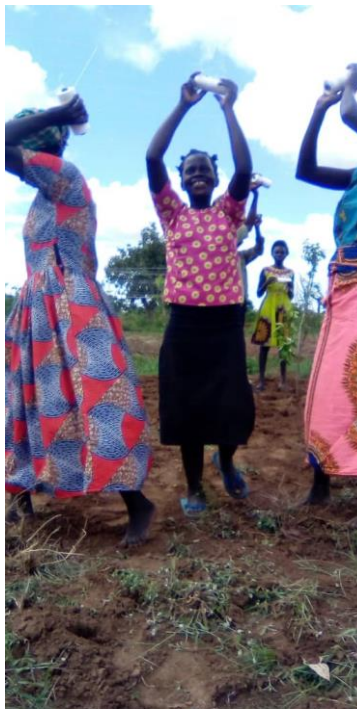
Photos: passion fruits (left) and women working on the land (right)

A monitor for the project was found via a partner organization of Peace SOS, Global Harmonization Initiative.