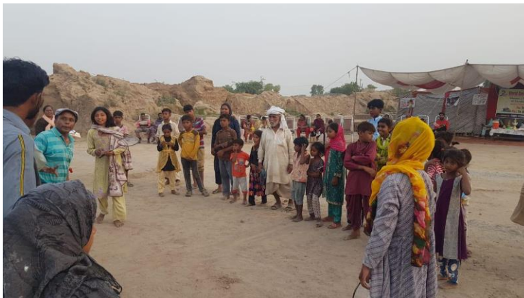
Photo: recreation day organized by CARE foundation in Pakistan

Another project of CARE was the celebration of 12th June Anti child labour day. The brick kiln factories children were invited to come forward and play together. Awareness sessions with parents for importance of education and skills were organized as well. In addition, government labour officers were invited to request them to provide maximum facilities of education and skills on these factories.