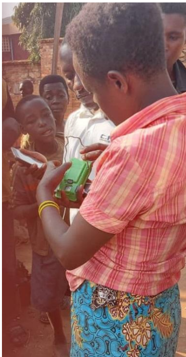
Photo: a lady with solar charger

In addition, Burundian Women for Peace and Development provided solar lamps to the people in Burundi. This was done in cooperation with World Solar Fund.