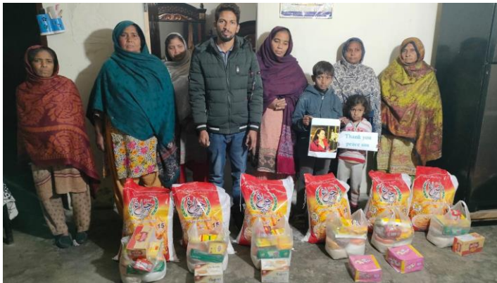
Photo: food provided to the women by the spiritual care taker

In addition, food is provided to widows via the spiritual care taker, so that the widows can save money to pay school fees for their children.