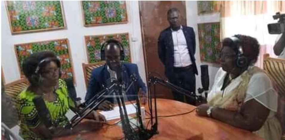
Photo: the studio in the community centre in Kirundo

In addition, Burundian Women for Peace and Development provided solar lamps to the people in Burundi. This was done in cooperation with World Solar Fund.