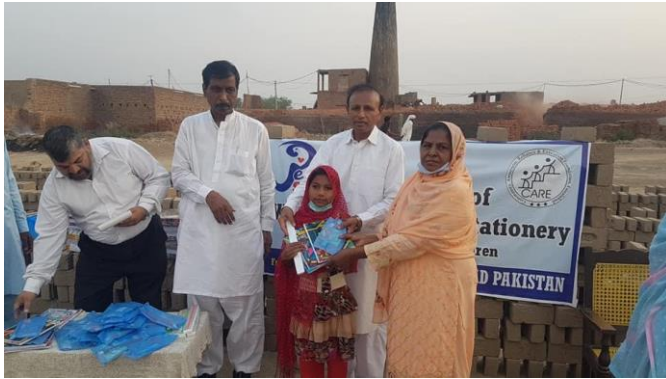
Photo: Distribution of school materials by CARE foundation

Another project of CARE was the celebration of 12th June Anti child labour day. The brick kiln factories children were invited to come forward and play together. Awareness sessions with parents for importance of education and skills were organized as well. In addition, government labour officers were invited to request them to provide maximum facilities of education and skills on these factories.