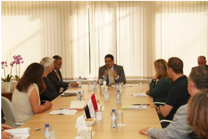
Photo: meeting with NGO's and the Yemeni Minister for Foreign Affairs and Expatriates