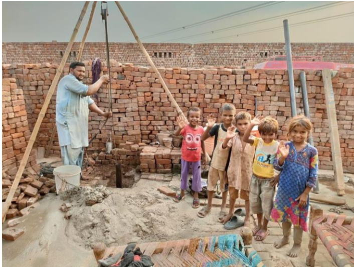
Photo: children and a man with the new installed water pump

In addition, food is provided to widows via the spiritual care taker, so that the widows can save money to pay school fees for their children.