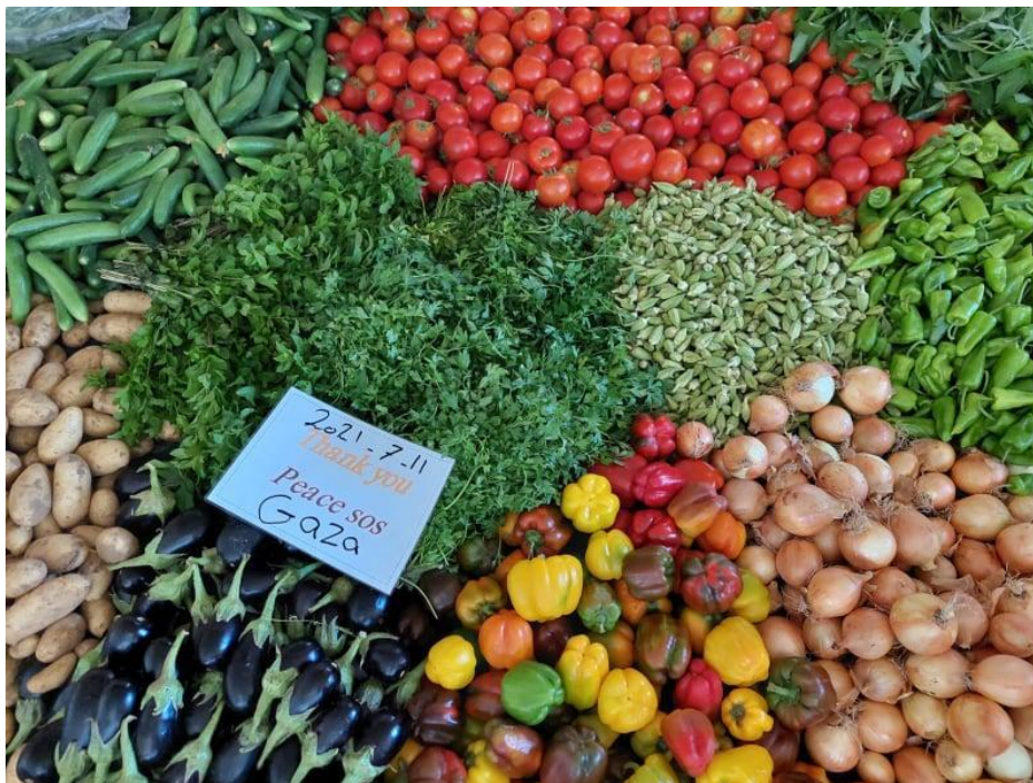
Photo: Vegetables for the people in Victory zone