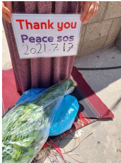
Photos: two children and a lady with vegetables.