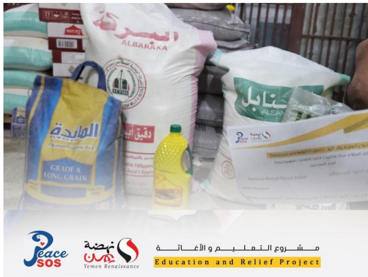
Photo: food baskets provided to vulnerable families by Yemen Renaissance

The war in Yemen, one of the poorest countries in the Arab world, is a humanitarian tragedy. Peace SOS supported Yemen Renaissance Organization to make sure that 100 poorest children in Taiz could continue their education. Food baskets were provided via a school. In addition, trainings were given to promote peaceful co-existence between the children.