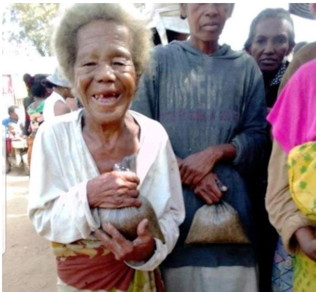
Photo: a local Malagasy lady receives a bag with rice